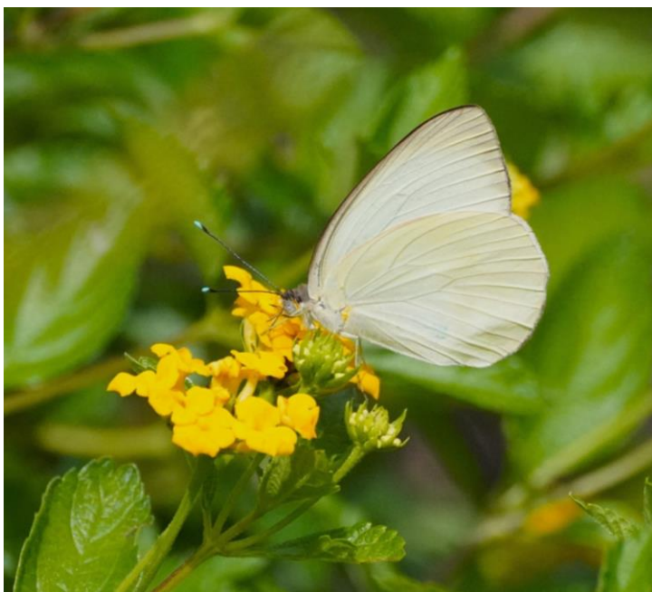
Florida White Butterfly