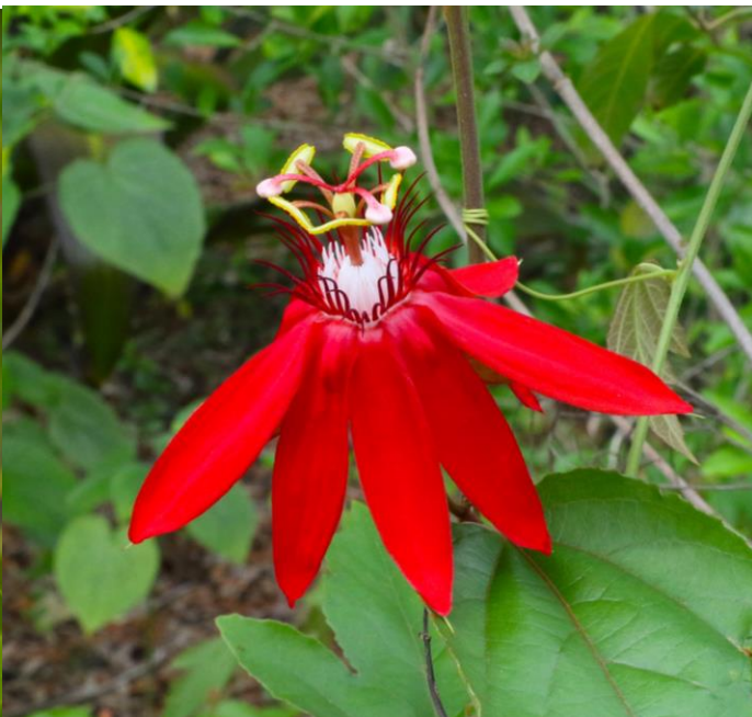
Red Passion Vine