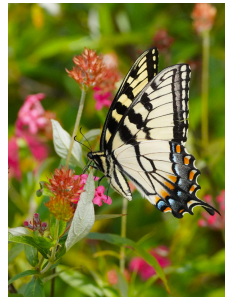
Eastern Tiger Swallowtail